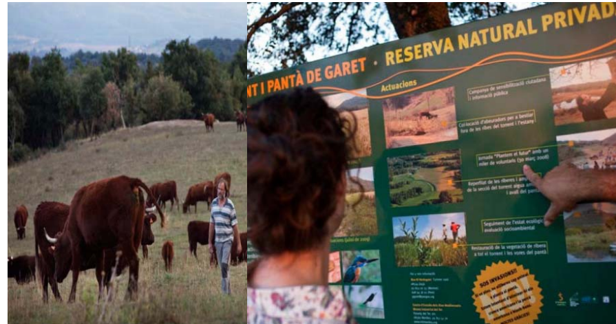
Garet Pond Private Nature Reserve by owner-farmer